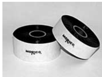
Foil Tape (Ink Ribbon)