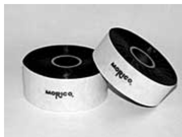
Foil Tape (Ink Ribbon)